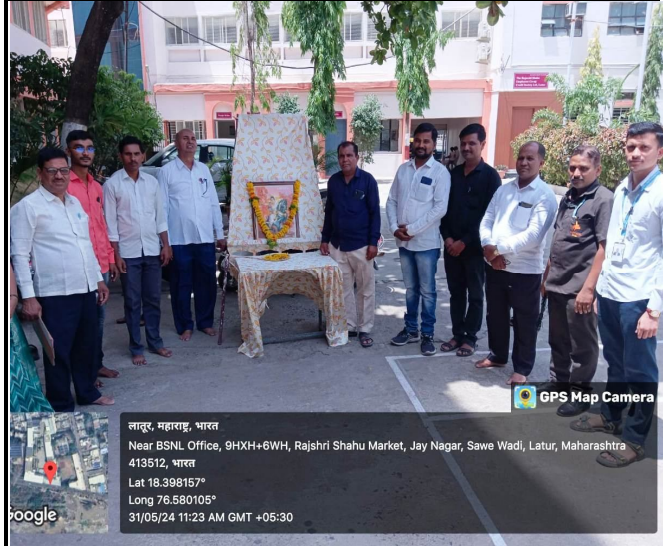
Student & Library staff participated in Ahilya Devi Holkar jayanti program.